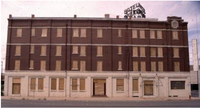
1987 Before restoration